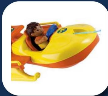
Go Diego Go Animal Rescue Boats