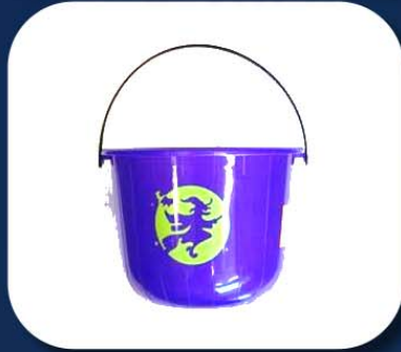
Purple Halloween Pails with Witch Decorations