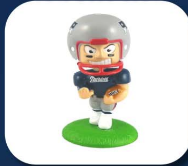
Football Bobble Head Cake Decorations