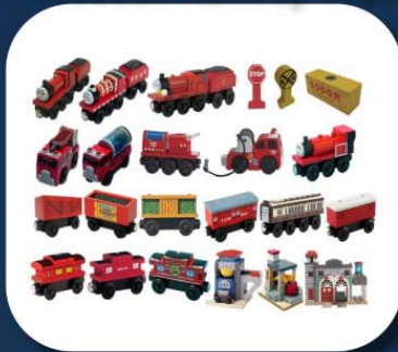
Thomas & Friends Wooden Railway Toys