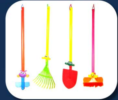
Children's Toy Gardening Tools