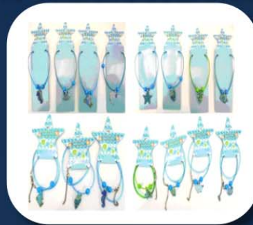
Beary Cute, Expressions, Sassy & Chic Children's Metal Jewelry