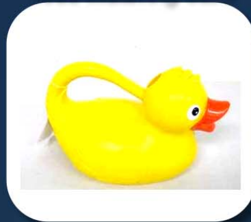
Robbie Duck Kids Watering Cans