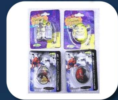
WeGlow Children's Metal Jewelry