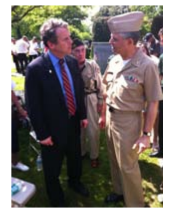
Sen. Brown speaks to a veteran on Memorial Day 2011.

Another Northwest Ohio constituent asked Sen. Brown to inquire with the Social Security Administration (SSA) about the status of