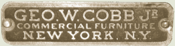
George W. Cobb's label is still found on several 1909 Senate desks and tables.

In 1933 the Senate office building was enlarged with a fourth wing along First Street. More than a thousand pieces of furniture, identical in style but made of walnut, not mahogany, were commissioned from three New York firms: W.H. Gunlocke Chair Co., the Company of Master Craftsmen, Inc., and the Sikes-Cutler Desk Corporation. Owing to the larger three-room suites in the new wing, 26 senators chose to move and brought their mahogany furniture with them. As a result, the walnut pieces were delivered to newly vacated offices in the older section of the building.