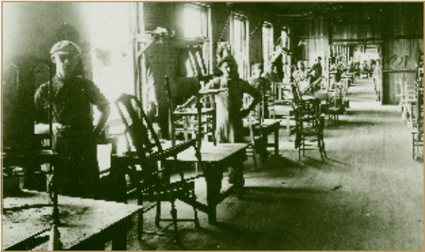
At the beginning of the 20th century, S. Karpen & Bros. was one of the country’s leading makers of upholstered furniture.