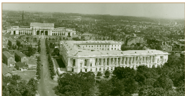
The Russell Senate Office Building, ca. 1920s.