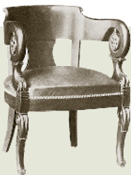
Round Arm Chair