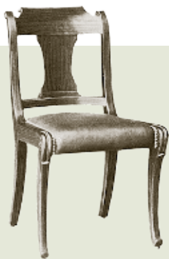
Small Side Chair

room for the secretary. A standard set of mahogany office furniture was made for each suite. The senator's set consisted of a flat-top desk, a swivel desk chair, two arm chairs, one small chair, an easy chair, a davenport, and bookcases (ordered at the senator's discretion after the building was occupied). The secretary's set included a rolltop desk and swivel chair, a rolltop typewriter desk and chair, a table, two armchairs, three side chairs, and a bookcase.