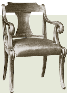
Square Arm Chair

In December 1908 the superintendent and the Building Commission decided to finish the building floor by floor, instead of wing by wing, requiring 40