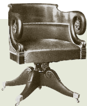
Round Arm Swivel Chair