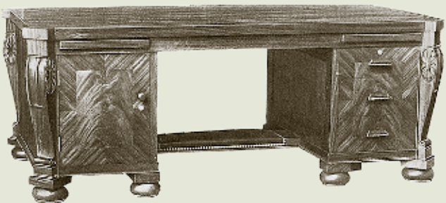
Flat Top Desk