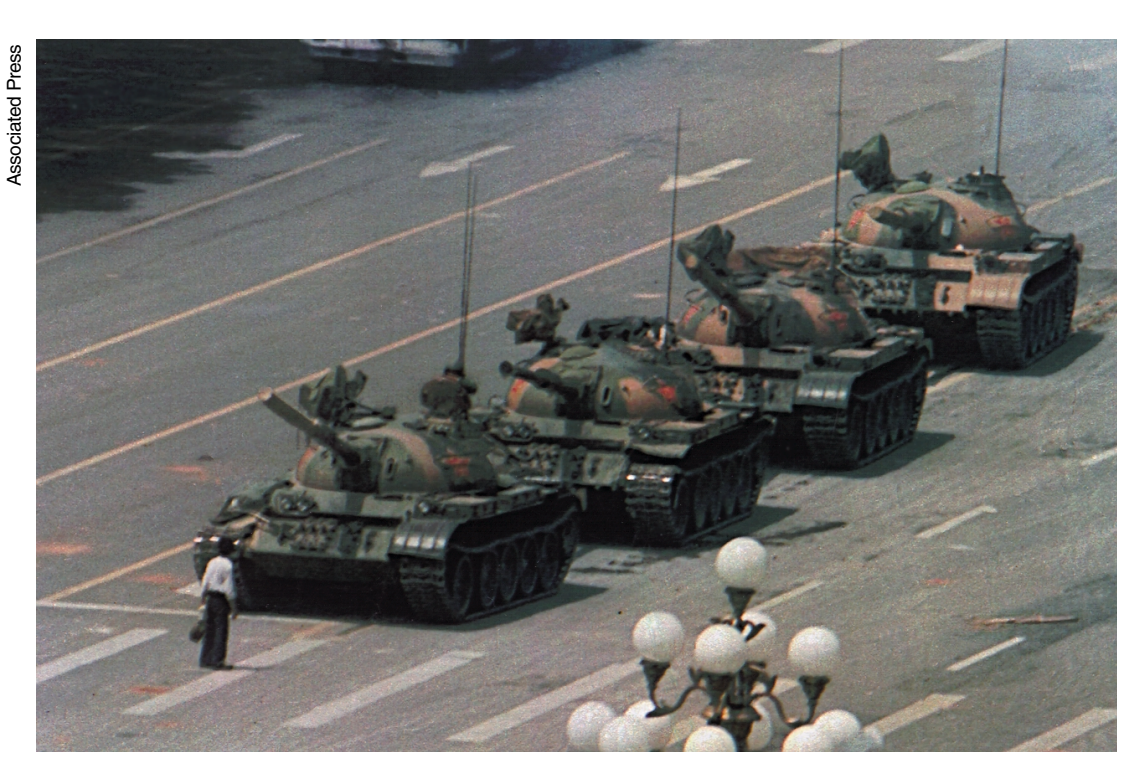
Prior to the June 4, 1989 massacre at Tiananmen Square in Beijing, the United States and other COCOM members differentiated between the People's Republic of China and the Soviet Union — and gave the PRC access to higher levels of technology.

When the 1988 Memorandum of Agreement on PRC commercial launch services expired on December 31, 1994, a third Memorandum of Agreement was signed in January 1995. This new agreement indicated that the PRC was not to launch more than 11 principal payloads to geosynchronous earth orbit or geosynchronous transfer orbit for international customers during the seven-year period ending on December 31,