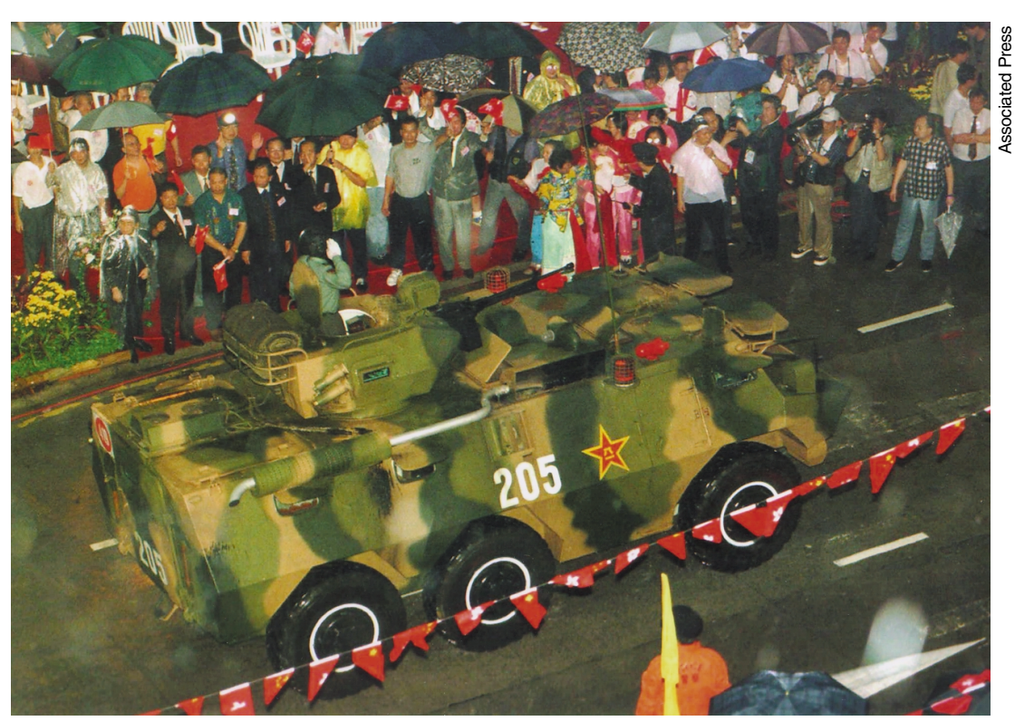
On July 1, 1997, legal control of Hong Kong reverted to the People's Republic of China, and troops from the People's Liberation Army entered Hong Kong. U.S. export policy, however, has continued to give Hong Kong the pre-1997 liberal controls on militarily sensitive technologies. As a result, export controls on the PRC were effectively liberalized on July 1, 1997, permitting the transfer of many additional technologies of potential use to the PLA without prior review by the Department of Commerce.

The 1992 Act called upon the U.S. Government to continue to treat Hong Kong as a separate territory in regard to economic and trade matters. It also provided for Hong Kong's continued access to sensitive U.S. technologies for so long as such technologies are protected.