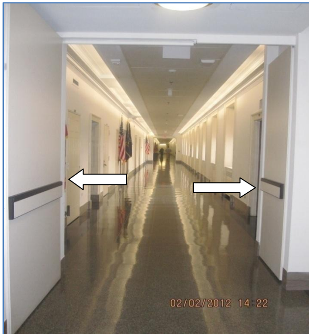
Longworth Cross-Corridor Doors in Open Position

After being notified that the OOC General Counsel was contemplating additional enforcement action, 44 the Architect developed a detailed plan known as the Senate Alternative Life Safety Approach (“SALSA”) to abate the hazards posed by the unprotected exit pathways, insufficient emergency exit capacity, and excessive exit travel distances, all conditions that fail to comply with the life safety objectives. SALSA addresses the emergency evacuation deficiencies and historicity issues by creating protected horizontal exit pathways through the use of solid cross-corridor doors. These doors lie flush against the corridor walls and only close when an evacuation alarm is activated. Because the doors are located in the corridors, they do not encroach on office space and can be installed without relocating or disturbing Senate offices. When closed, the doors create separate zones within the building that isolate fire and airborne toxins within one zone; consequently, Senators, staff, employees and visitors are able to quickly escape the zone where the danger is located by moving into an adjacent zone that is protected by the doors against the rapid spread of fire and airborne toxins. 45 The Architect’s historian found