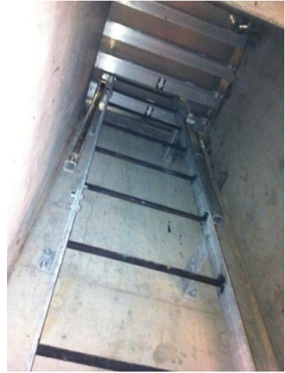
New egress, ladder, and hatch