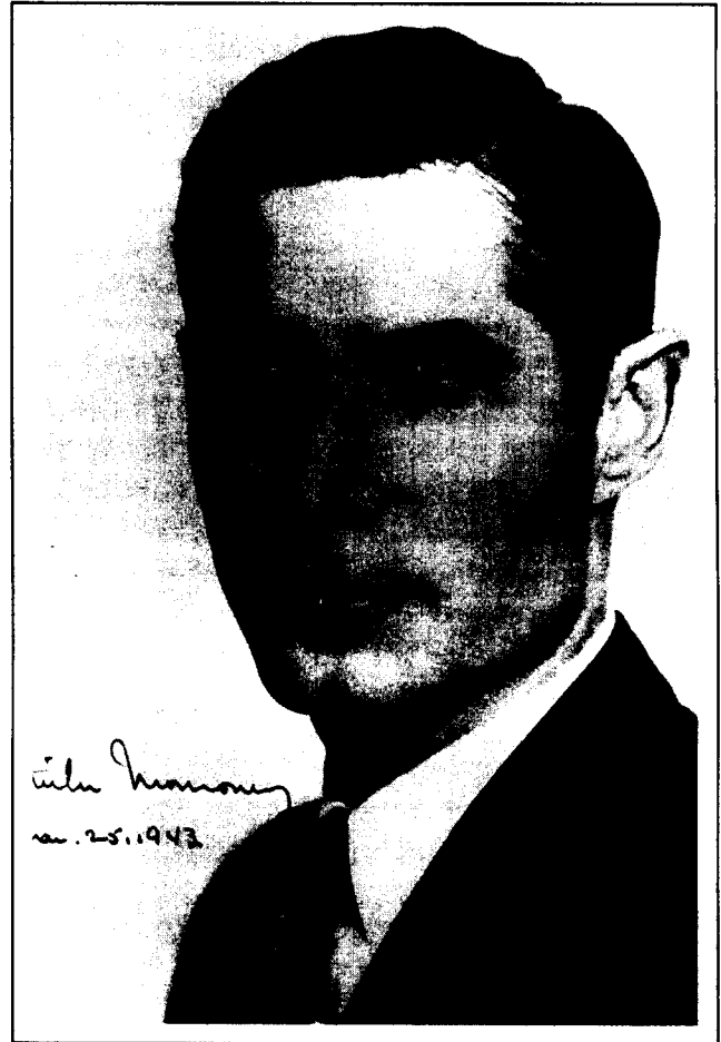
A. S. Mike Monroney led reform initiatives from the House in the 1940's and the Senate in the 1960's.

In November 1943, the chances for an effective reorganization appeared better than