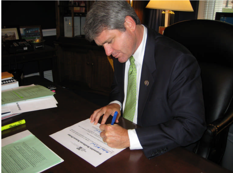
Congressman McCaul signs the Health Care Reform Pledge

2009. In addition, this bill provides for more than 700 earmarks. Because this bill continues the trend of overspending in Congress, I voted against this legislation.