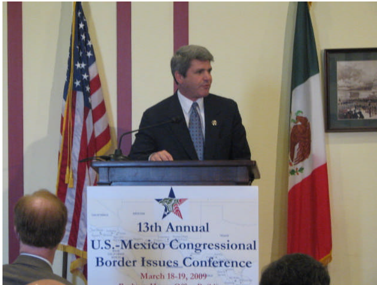
Congressman McCaul co-chairs the 13 th Annual U.S.-Mexico Congressional Border Issues Conference.

On Thursday, I co-chaired a bipartisan Congressional conference to discuss the United States' role in combating Mexican drug cartels. The purpose was to address the unique challenges that face the U.S.-Mexico border region including, but not limited to, the environment, energy, health, immigration, security, infrastructure modernization, and trade. Attendees included key government officials and representatives of private industries from both countries. I believe that this constructive dialogue will help provide policy makers with a more complete and accurate understanding of border issues in order to offer potential solutions.