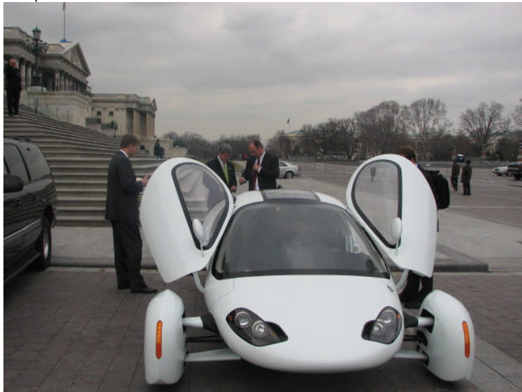
Congressman McCaul rides in a prototype electric car on the Capitol grounds.