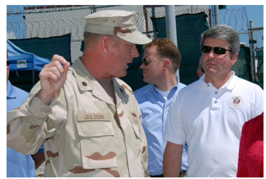
Congressman McCaul touring the terrorist detention center in Cuba Monday.

Tomball, TX 990 Village Square, Suite B Tomball, TX 77375 281.255.8372