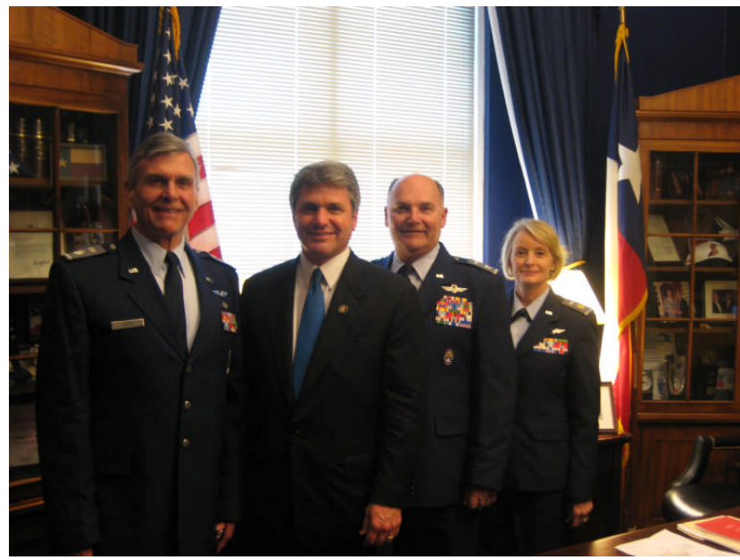
Congressman McCaul meets with members of the Civil Air Patrol.