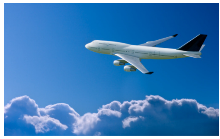
Official travel may not exceed 60 consecutive days.

Official travel cannot originate from or terminate at a campaign event. Official travel may not be combined with or related to travel or travel-related expenses paid for with campaign funds.