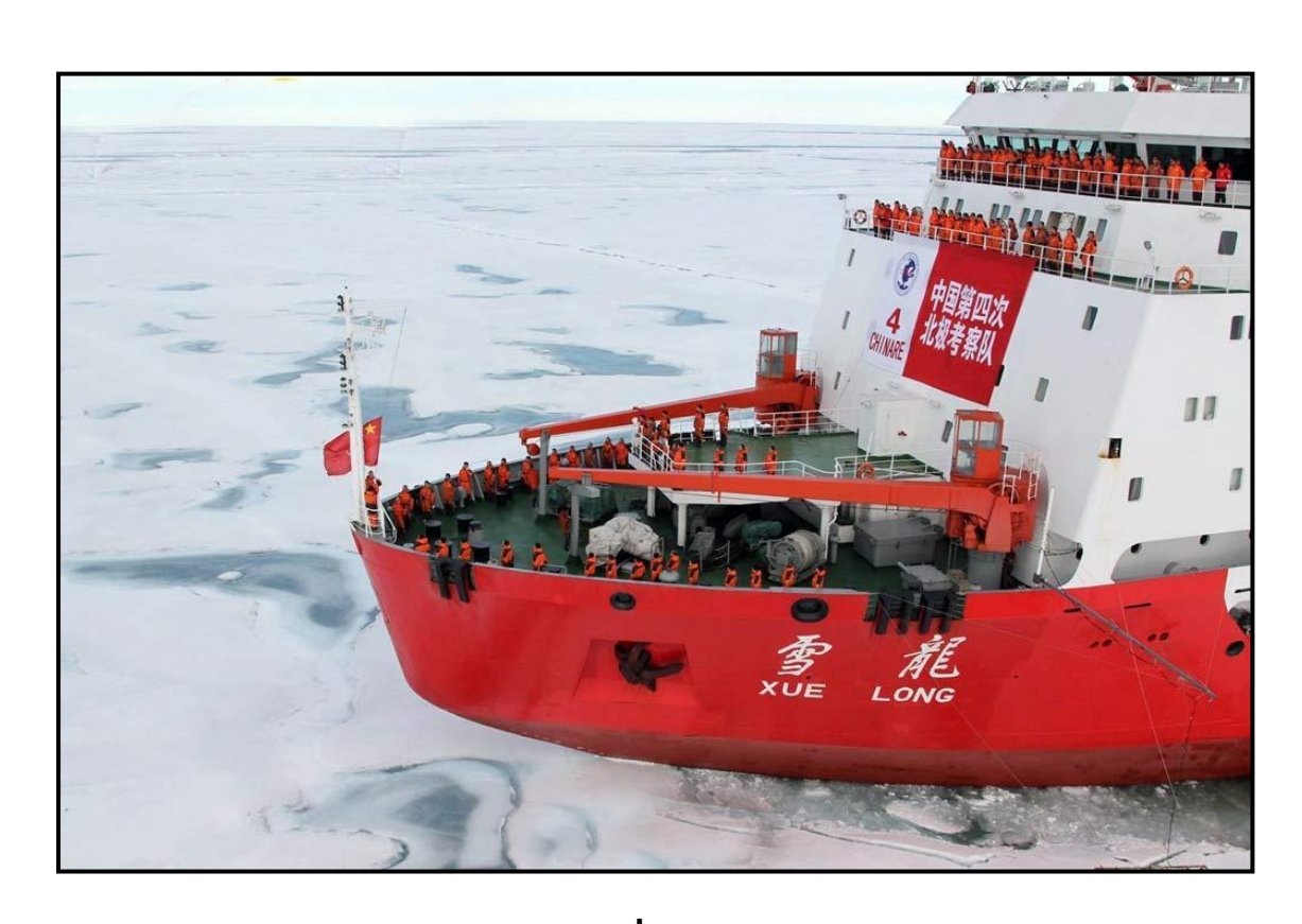
by Caitlin Campbell USCC Policy Analyst, Foreign Affairs and Energy