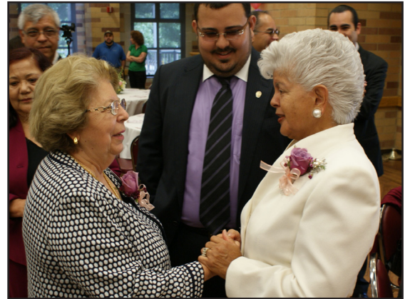
Rep. Napolitano discusses social services issues

For more information visit www.napolitano.house.gov