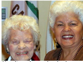
Napolitano honors local volunteers

Honored by Rep. Napolitano for extraordinary volunteer service to the community