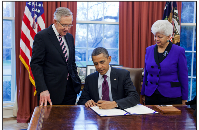
Rep. Napolitano and Sen. Reid look on as Pres. Obama signs the Hoover Power Allocation Act, which sends power to California cities

Pres. Obama signed Napolitano’s Hoover Power Allocation Act into law, ensuring that several states and many local cities like Azusa, Pasadena, and L.A. can continue to receive the Hoover Dam’s low-cost electricity through 2067. Napolitano initially introduced the bill in 2010.