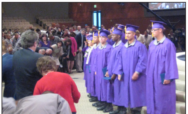
A recent class of graduating Sunburst cadets