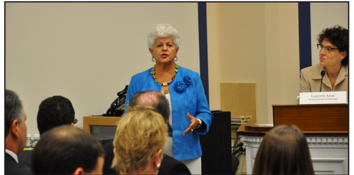
Napolitano discusses water issues at a briefing in Washington, DC provide additional water for Southern California, and also create more good paying jobs. A study by the Economic Roundtable showed that water infrastructure creates more jobs than any other kind of government investment. It is also critical to create a stable water supply that can support all of California.

Pres. Obama recently signed Napolitano's Water Desalination Act of 2011 into law, which will provide funding for research and development of better desalination technology that converts ocean saltwater into drinking water. When perfected, this technology would