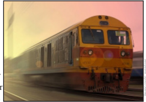
More than 160 trains travel through the 38th Congressional District every day

Hundreds of trains going to and from our ports pass through L.A. County every day. Metrolink has voluntarily committed to install PTC in all of its trains by 2015, but the weakening of PTC provisions would affect all other railroads.