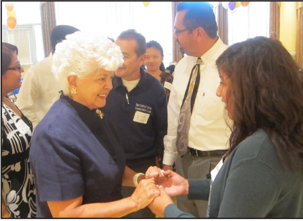
Napolitano discusses mental health issues and local education with one of her constituents

Pacific Clinics' Youth Suicide Prevention Program celebrated its ten-year anniversary with local students, families, and teachers. The program was started with a federal earmark secured by Rep. Napolitano in 2001. She has continued to support the program as it has expanded into 15 local schools.