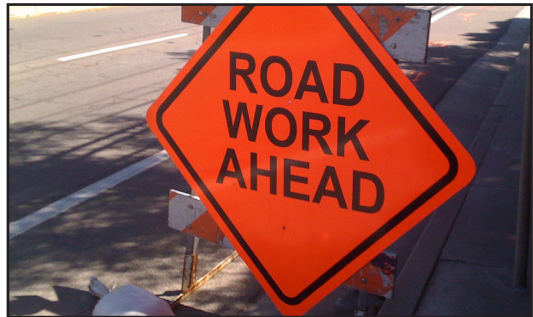
The Paramount Boulevard overpass is now closed for construction

When a tanker truck exploded under the Paramount Blvd. overpass in Montebello, Rep. Napolitano immediately contacted Gov. Jerry Brown and Transportation Secretary Ray LaHood to elicit a quick response. Rep. Linda Sanchez and Rep. Judy Chu also signed onto the effort. Once a California State of Emergency was put in place, federal reconstruction funds were committed the day after. The overpass should be completed before fall. "We must continue to act quickly, as it is critical this overpass be rebuilt as soon as possible," Napolitano said.