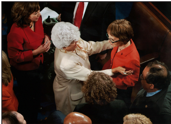
Rep. Napolitano and Sec. Hilda Solis greet Rep. Gabby Giffords at the State of the Union. Congresswoman Giffords chose to resign so she can focus on continuing her remarkable recovery from the 2011 shooting in Tucson, AZ.