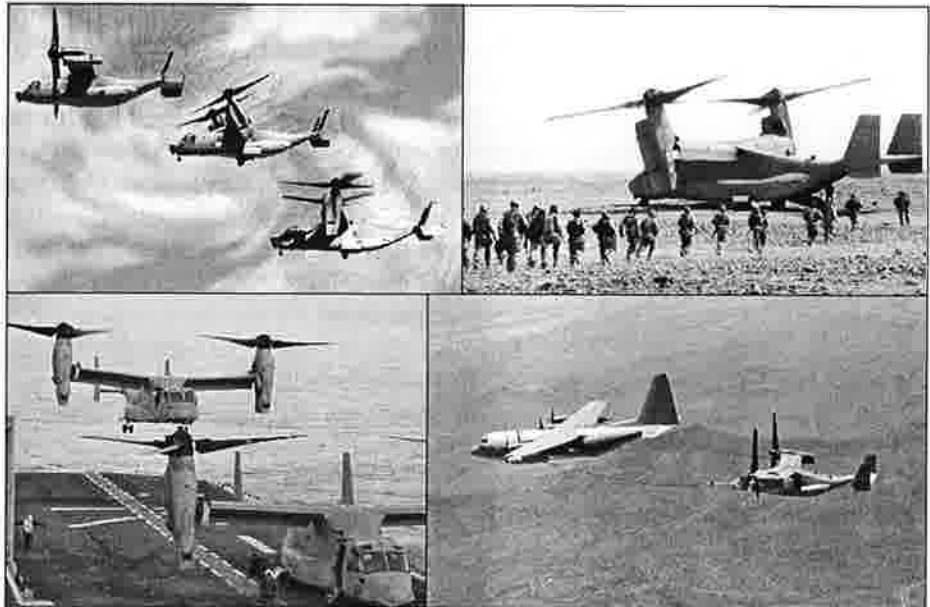
Figure 1: Views of V-22 Aircraft in Various Aspects of Use

The V-22 Osprey is a tilt-rotor aircraft—one that operates as a helicopter for takeoffs and landings and, once airborne, converts to a turboprop aircraft—developed to fulfill medium-lift operations such as transporting combat troops, supplies, and equipment for the U.S. Navy, Marine Corps, and Air Force special operations. Figure 1 depicts V-22 aircraft in various aspects of use.