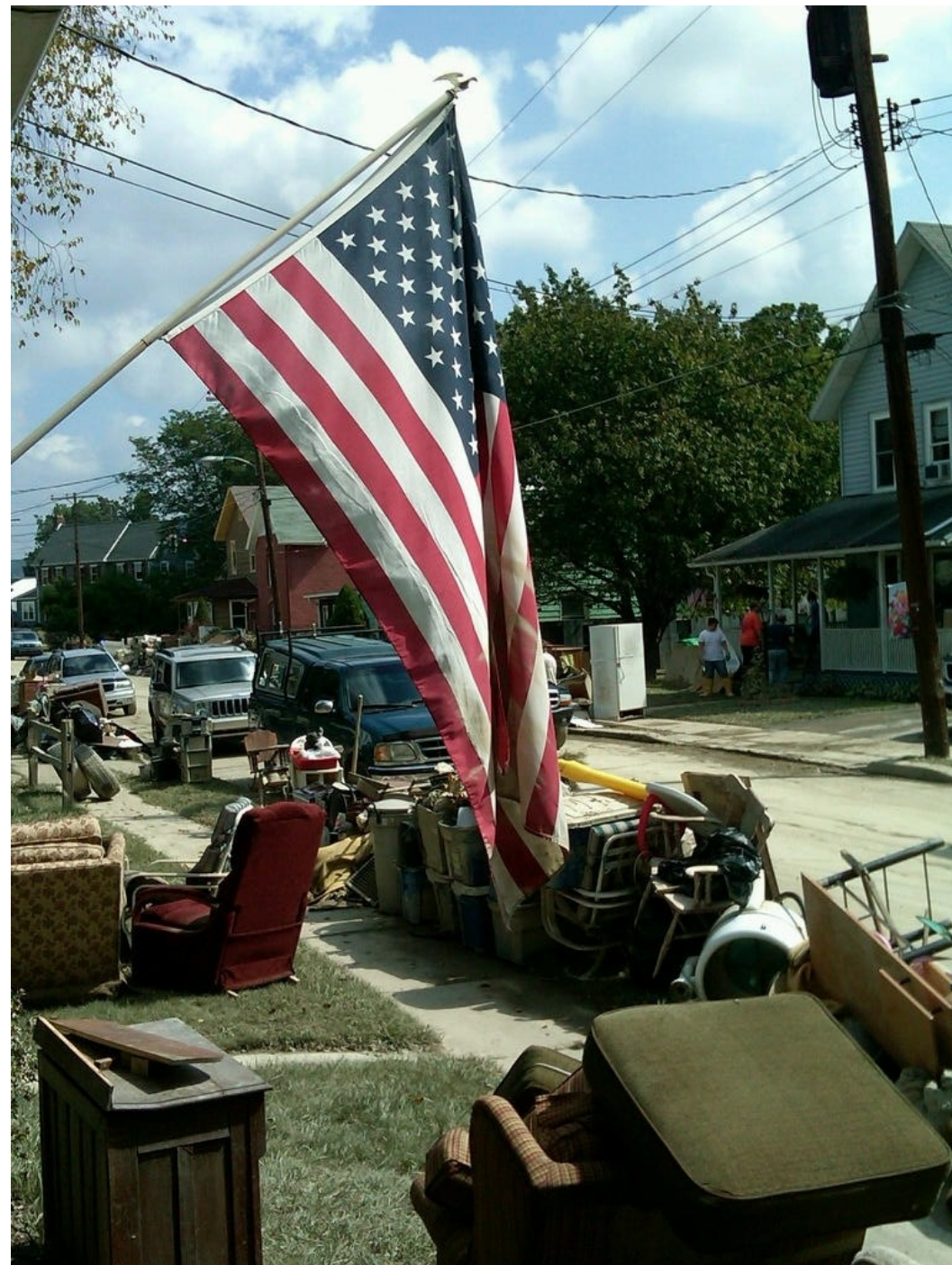
As the property owner in Athens, Bradford County, cleared the debris from his damaged home, he still took the time to fly the American flag. This gesture exemplifies the optimism, goodwill and patriotic spirit that abounds throughout the district, even in the most troubled times.