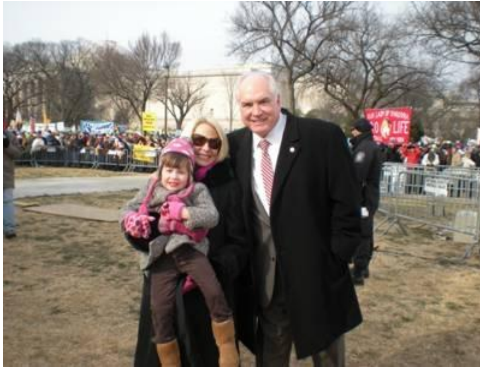
Photo: Rep. and Mrs. Kelly with their granddaughter at the 2011 National March for Life

The Protect Life Act will not only amend Obamacare to statutorily prevent federal funding of abortion or abortion coverage, with exceptions in cases of rape, incest, and when the life of the mother is at stake; it will also strengthen conscience protections for health care professionals who are morally opposed to abortion. By enforcing stronger restrictions against taxpayer-subsidized abortions, the Protect Life Act will not only protect Americans' religious liberties, but will also honor the will of the American people, a majority of whom are against publicly-funded abortions.