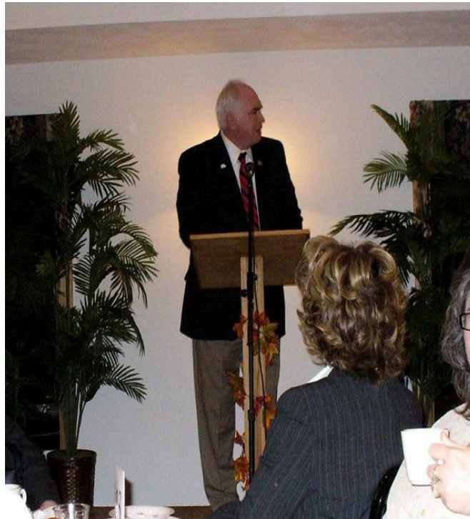
Photo: Rep. Mike Kelly attends the Crawford County Pro- Life Dinner on October 28