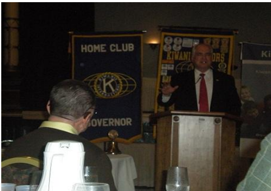
Photo: Rep. Kelly talks about the need for statesmanship in Washington to the Kiwanis Club of Erie