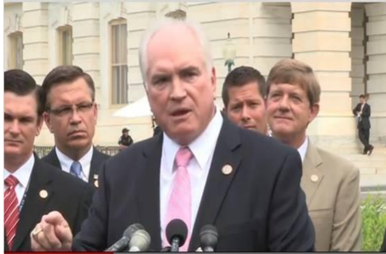
Photo: Rep. Mike Kelly speaks in front of the U.S. Capitol during a press conference on the Budget Control Act.

CLICK HERE to Play Video of the Press Conference