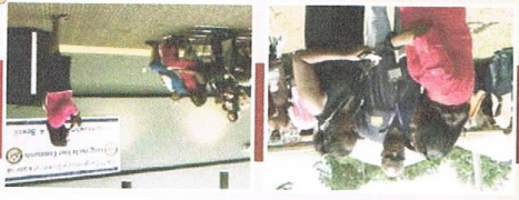
Congresswoman Sewell holds town hall meetings at the Free Press West Library in Birmingham.