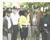
Congresswoman Sewell visits with Alabama veterans.

For more information and to sign up for news, the e-newsletter and our grant guide, please visit www.sewell.house.gov