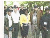
Congresswoman Sewell visits with Alabama veterans.

For more information and to sign up for news, the e-newsletter and our grant guide, please visit www.sewell.house.gov