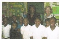
Congresswoman Sewell visits with students at Cedar Park Elementary School in Selma.