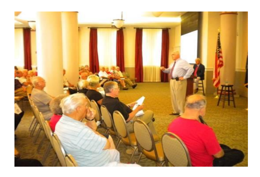
Photo: Rep. Mike Kelly talks with constituents at Grove City College during the September 1 "Ask Mike" public forum.

Poll question: Do you agree with President Obama's plan to raise tax rates for individuals and job creators earning $200,000 or more a year?