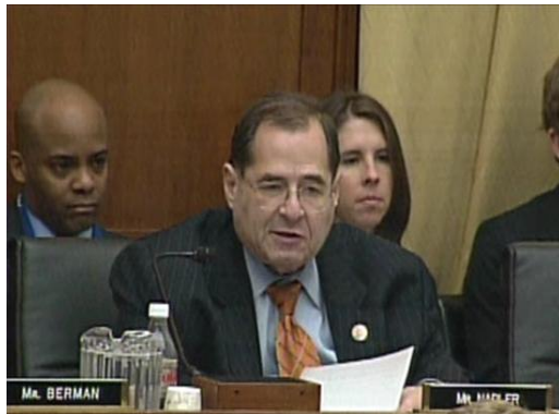
Rep. Nadler condemns a recent ploy to undermine the right to choose. Watch the video.

The last few weeks have seen a resurgence in the right-wing's assault on the rights of women. These attacks have taken many forms, including an attempt to undermine the free contraceptive coverage that was a part of the health reform law. In the House Judiciary Committee, we have also seen a renewed attack on reproductive rights in the form of H.R. 3541. This bill would force doctors to guess the motive of any woman seeking an abortion and to then refuse her request if the doctor determines her reason for terminating the pregnancy is based on the race or sex of the fetus.