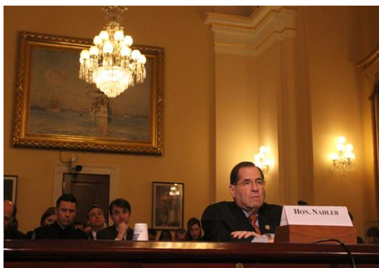
Rep. Nadler testifies on the need for 100% scanning of maritime cargo before it reaches our nation's vulnerable ports. Watch the video.

The ports and maritime facilities that connect our businesses to the