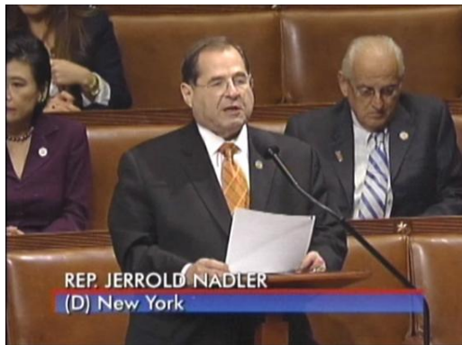
Rep. Nadler introduces his amendment to protect nuclear safety regulations. Watch the video.

The fanatical drive to gut rules protecting public safety has reached a new and dangerous low. Spurred on by an extremist, tea party ideology, the Republican-controlled House voted to undermine the government's ability to protect Americans from disasters at nuclear power plants. They did so by rejecting my amendment which would have protected safety rules proposed by the Nuclear Regulatory Commission (NRC) from this slash-and-burn regulatory philosophy.