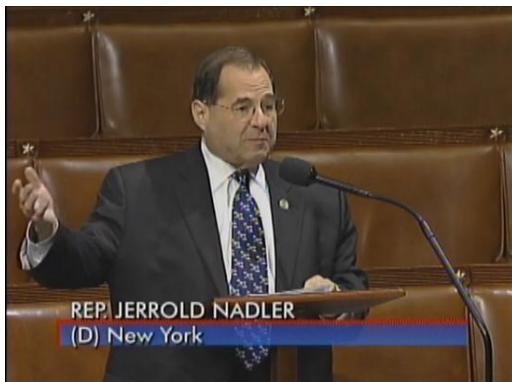
Rep. Nadler speaks on the House floor in support of a resolution to end U.S. military involvement in Libya. Watch the video.

Recently, I took to the House floor to oppose the U.S. military operation in Libya. We cannot allow the president – not just this president, but any president – to have the unchecked power to commit our nation to war. This is why the Constitution requires the use of military force to be authorized by Congress. Obtaining this authorization from Congress before a sustained military campaign is a crucial part of our constitutional system of checks and balances and, as the senior Democrat on the Constitution Subcommittee, I take the issue very seriously.