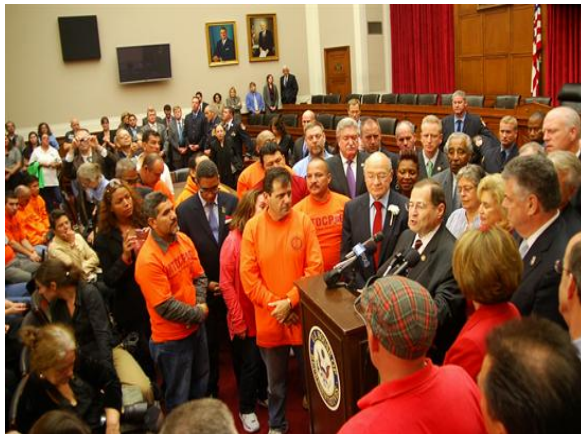
Rep. Nadler speaks at a press conference with Speaker Pelosi, the New York Congressional delegation, and community members to commemorate House passage of the "9/11 Health and Compensation Act."

After nine years of fighting, the House finally passed the 9/11 Health and Compensation Act . The bill, which I sponsored along with Congresswoman Carolyn Maloney, would ensure treatment and compensation for those made sick by the toxic chemicals released by the collapse of the World Trade Center on 9/11. Nearly a decade after the attacks, thousands of first responders, community members, students, and area workers remain sick with often debilitating 9/11-related illnesses. This long overdue measure is an essential part of our effort to honor the heroism and sacrifice that have become the hallmarks of that terrible day.