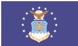
U.S. AIR FORCE

For more information please call Sue at (610) 434-1444 or Jason at (610) 770-3490