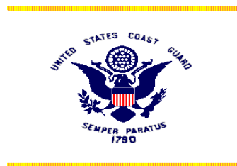
U.S. COAST GUARD

Talk with Senator Toomey, Congressman Dent and representatives of the Air Force, Naval, Merchant Marine and Coast Guard Academies, the U.S. Military Academy at West Point and the R.O.T.C. to gain a better understanding of the nomination and admission process