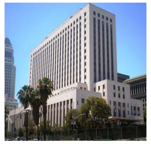
312 N. Spring Street Courthouse (Discontinue use for federal court)