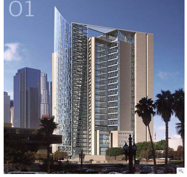
Proposed L.A. Courthouse ($400 million construction)

0 Current Courtrooms +24 July 2011 Proposal