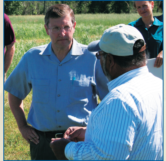
Senator Conrad meets with scientists at USDA's research laboratory in Mandan. The North Dakota researchers are performing cutting-edge research turning North Dakota's crops into domestic sources of energy.

"This bill encourages the use of domestic sources of energy and will help America look to the farm fields of the Midwest instead of the oil fields of the Mideast," Senator Conrad said.