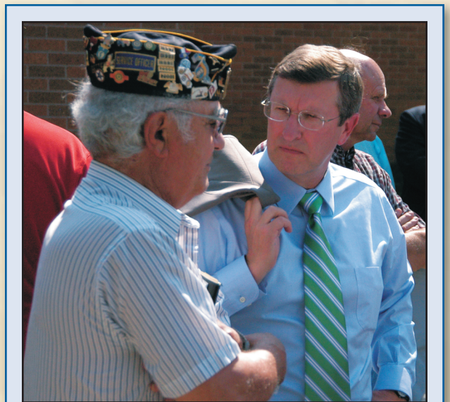
Veterans and local leaders at the opening of an outpatient clinic in Dickinson.

Senator Conrad, one of the Senate’s leading deficit hawks, has been among the most vocal opponents of the Administration’s fiscal policies, which have resulted in a ballooning national debt that jeopardizes the nation’s long-term fiscal security.