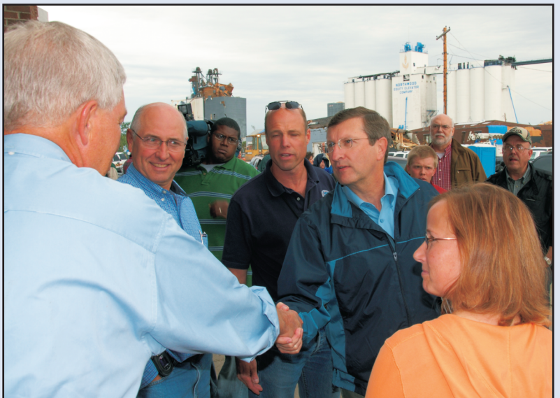
Senator Kent Conrad meets with residents of Northwood two days after a tornado struck the town. Senator Conrad worked with North Dakota's leaders to secure federal disaster assistance for Northwood families and businesses.

“Disaster relief is a big victory for family farmers and ranchers in North Dakota and across the nation,” Senator Conrad said. “The overwhelming support for disaster assistance demonstrates yet again that the U.S. Congress now stands with our nation's farmers and ranchers.”