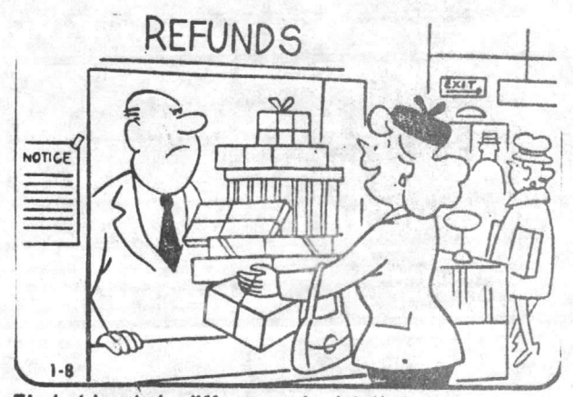
Find at least six differences in details between panels.