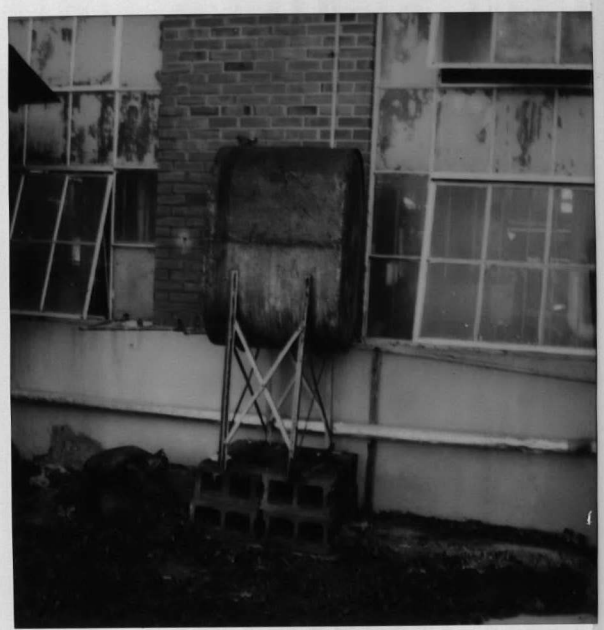
(Reld perc) 1986/1987