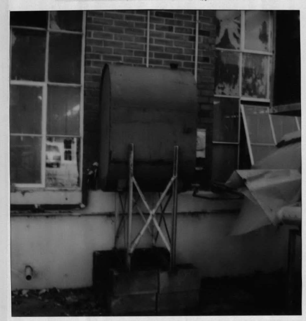
(Rold pure) 1986/1987