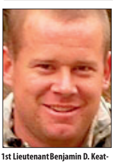
ing, 27 Shapleigh, Maine 3rd Squadron, 71st Cavalry Regiment 3rd Brigade Combat Team, 10th Mountain Division Died in a non-hostile vehicle accident