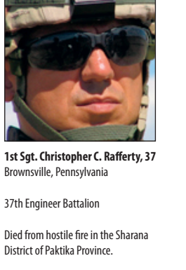
37th Engineer Battalion District of Paktika Province.