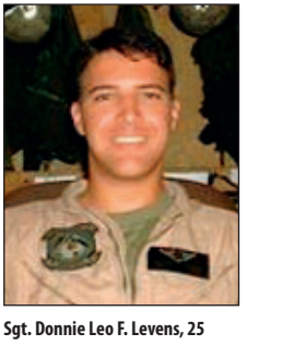
Long Beach, Mississippi Marine Heavy Helicopter Squadron 464, Marine Air Group 29, 2nd Marine Aircraft Wing, II Marine Expeditionary

Died from non-combat related injuries sustained in the Gulf of Ader