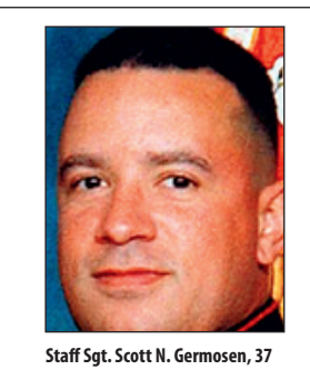
Marine Aerial Refueler Transport Squadron 352, Marine Aircraft Group11, 3rd Marine Aircraft Wing Died due to an aircraft crash in southwestern Afghanistan.