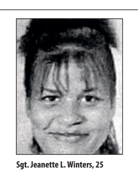
Marine Wing Communications Squadron 38, 3rd Marine Aircraft