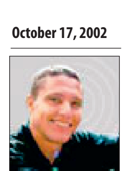
Tallahassee, Florida Navy SEAL assigned to the U.S. Embassy, Yemen.