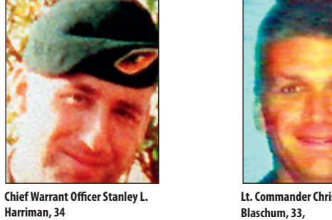
Wade, North Carolina 3rd Special Forces Group (Airborne)