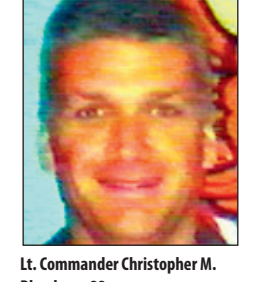
Fighter Squadron 143, Naval Air