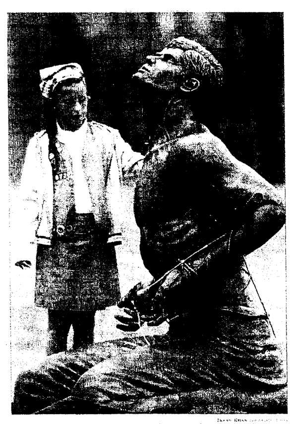
A.ORAL TRIBRITE: Juppa Powers 1997 Series From The in Riverside places of may 1957 to be on semiconful for an isomers of a remail those remaining to perform.