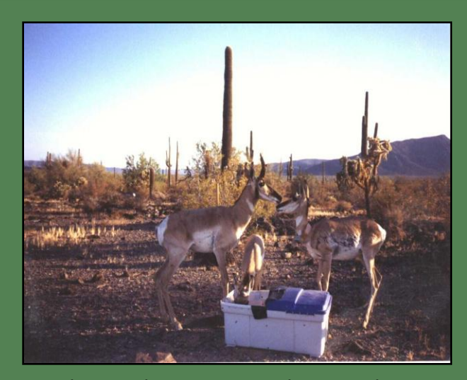
Endangered Sonoran pronghorn antelope in Organ Pipe Cactus National Monument

"A biological monitor shall be present at the proposed location of AJO-004 to monitor for Sonoran Pronghorn prior to any disturbance/drilling. The monitor must have experience with observing pronghorn. The monitor will scan the area for pronghorn and if observed, the drilling will be delayed until the pronghorn moved of their own volition. The pronghorn cannot be 'encouraged' to vacate the area."