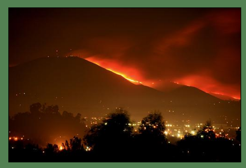
The Harris Fire in 2007 that was started by illegal immigrants outside of San Diego.