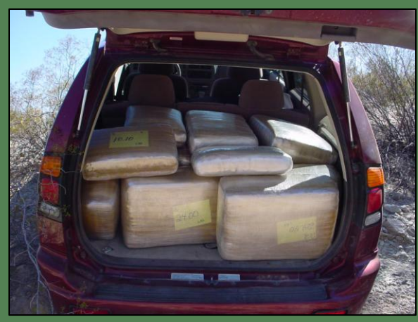
Drugs seized in a vehicle entering the Organ Pipe National Monument in Arizona