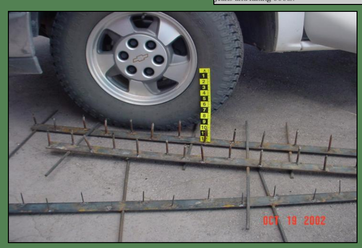
Tire spikes found on DOI land near the border in Arizona

According to the report, wounds indicated a gunshot to the right leg as well as a wound to his left leg where a tourniquet had been applied and wounds to the man's head. The man was wearing a short-sleeve Western-style shirt, blue jeans and hiking boots.