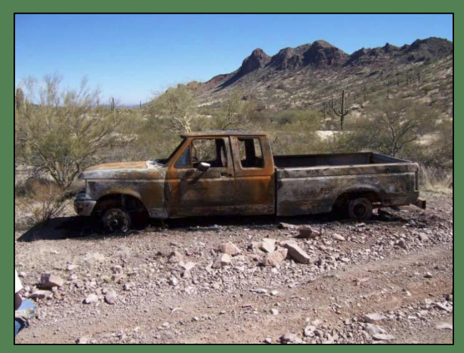
Abandoned vehicle found in the Sand Tank Mountains