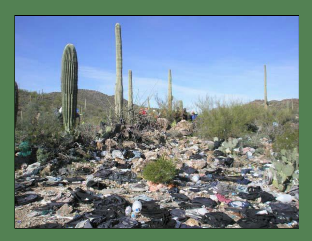
Trash on BLM land in the Roskruge-Recortado Mountains, 2008.