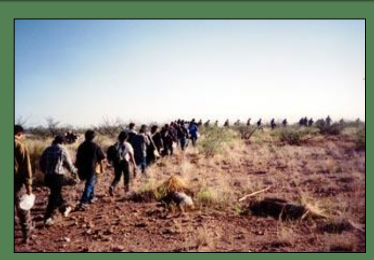
Heavy foot and vehicle traffic by illegal smugglers causes considerable damage to the land – as shown here from _____.

"The Buenos Aires National Wildlife Refuge has 5 1/2 miles of border within the corridor. Its land has been badly staggered by illegal immigration and drug smuggling, and visitors can see evidence of it within moments of arriving. The parking lot is surrounded by steel rails and a locked gate, and the office has bars on the windows and expensive security doors. It looks like a building in a dangerous inner-city neighborhood, not an 118,000-acre preserve in some of Arizona's most picturesque land."