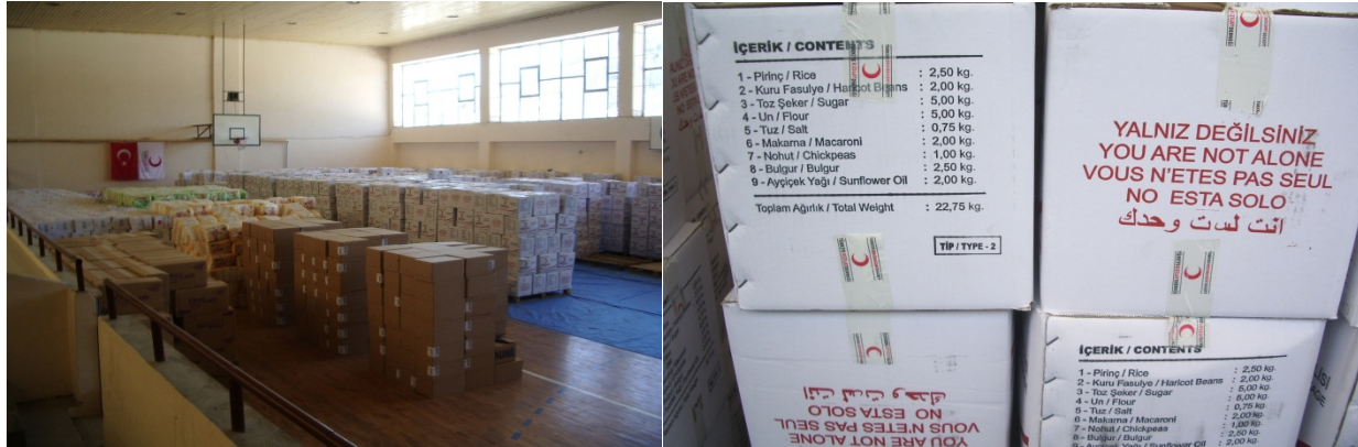
A gym near the Turkish/Syria border converted to a warehouse to store items for Turkish Red Crescent's "Zero Point Distribution"