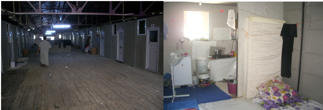
A Turkish warehouse converted to house Syrian “guests”

Staff visited an abandoned two-story warehouse that had been subdivided using sheetrock/drywall into multiple units, each with a door and window facing a common hall, with a stove and water jug, as well as an operating electric fan. While not paradise by any means, it is miles above Za'atri. Refugees are allowed to leave camp from 8am-8pm and local press reports said they were a boon to the Turkish agricultural industry. Those with money they brought or from friends were able to outfit their rooms as needed and one had even purchased an air conditioner.