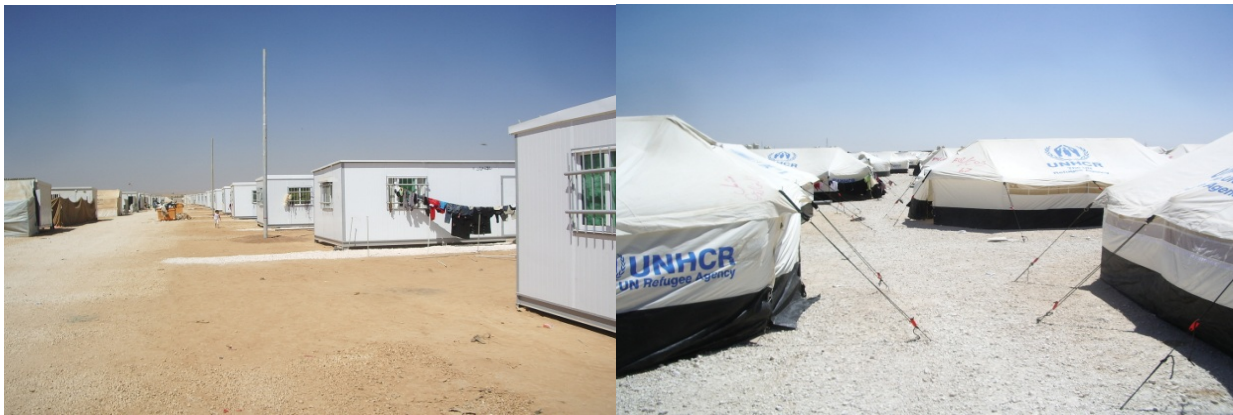
Container housing in Za'atri