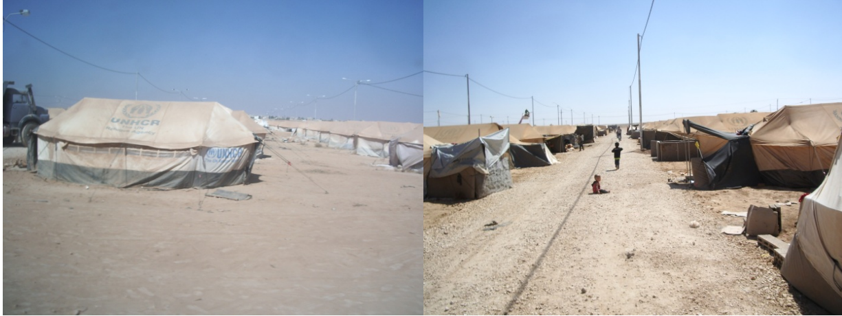
Dust covered UNCHR tents in the original Za'atri camp