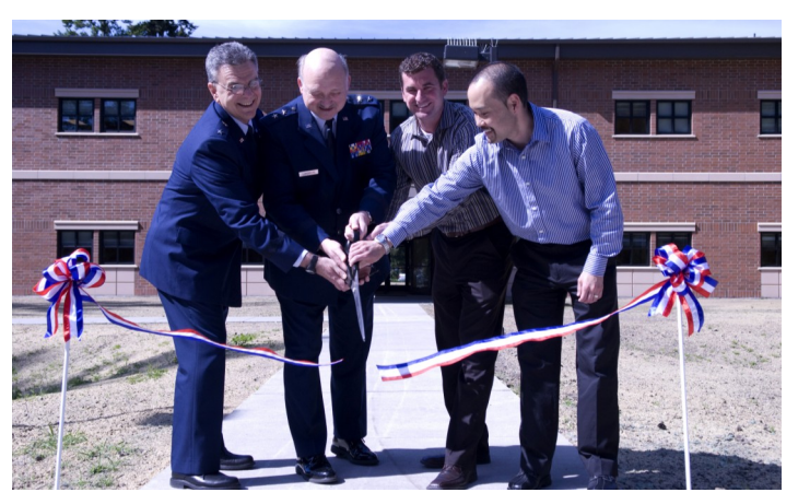
Ribbon cutting for the new 262nd NWS building

I believe a wide-ranging agreement is possible, and it was right to delay raising the debt ceiling in an effort to find a comprehensive solution for our fiscal and economic mess. But now, only days from the Tuesday deadline, our window of opportunity is closing. The debt ceiling must be raised, with or without a larger agreement. If we go forward without encouraging economic growth and tackling the national debt, however, our job will not be done. I will fight to encourage my colleagues to adopt a legislative package that restores fiscal responsibility and puts America's economy back on track as soon as possible.