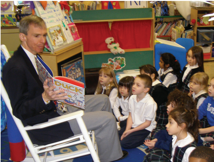
Lipinski visits with students at St. Patricia School in Hickory Hills during Catholic Schools Week and discusses his work in Congress.

In January , Rep. Lipinski honored the 35th Anniversary of Catholic Schools Week with a resolution recognizing the contributions of Catholic schools. The resolution passed the House on a unanimous vote. Established in 1974, Catholic Schools Week celebrates Catholic