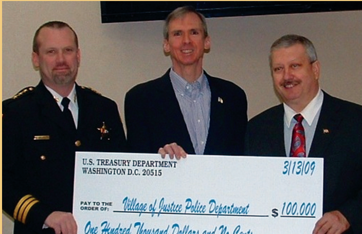
Lipinski announces federal funding for the Village of Justice police department.

FOR FY2009 , Lipinski secured over $6.5 million for local projects, including: