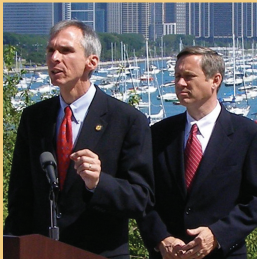
Lipinski discusses bill to stop sewage dumping in the Great Lakes.

As a national leader on environmental issues the congressman has fought to keep our communities safe from potential pollutants, including helping to stop BP from dumping dangerous materials from their Indiana refinery into Lake Michigan. And earlier this year Lipinski helped introduce the Great Lakes Water Protection Act (H.R. 54) which would establish a federal deadline to end sewage dumping in the Great Lakes.