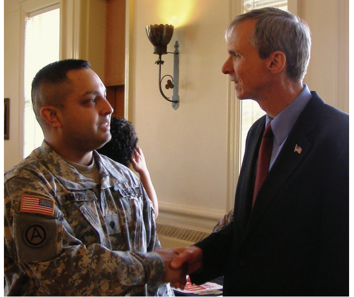
Lipinski discusses the impact of the bad economy on seniors and veterans at Hometown Heroes event.

Lipinski will continue to protect and defend Social Security and Medicare for seniors, just as he stood up to help defeat Social Security privatization which would have proven disastrous with the decline of the stock market. The congressman is also dedicated to providing veterans with the support they deserve, and in April helped pass an 11.7% increase in funding for veterans' health care services and benefits in 2010.