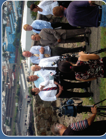
U.S. Rep. Bill Pascrell, Jr. announces a federal grant funded by the Recovery Act for the resurfacing of I-80.