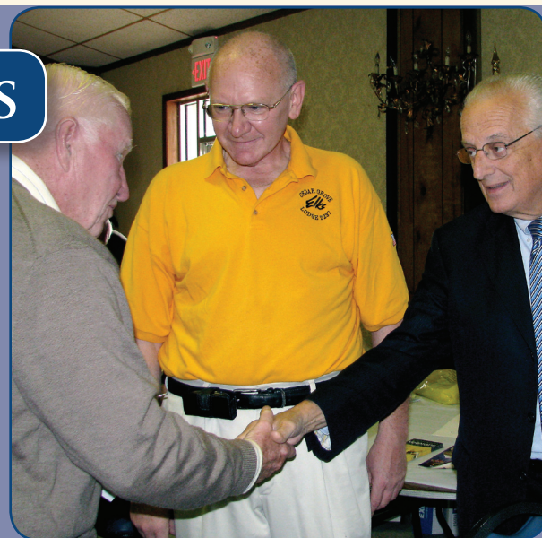
U.S. Rep. Bill Pascrell, Jr. meets with 8 th District seniors to discuss how the Federal government can address their concerns.

The Recovery Act has already helped the senior community during this economic recession.