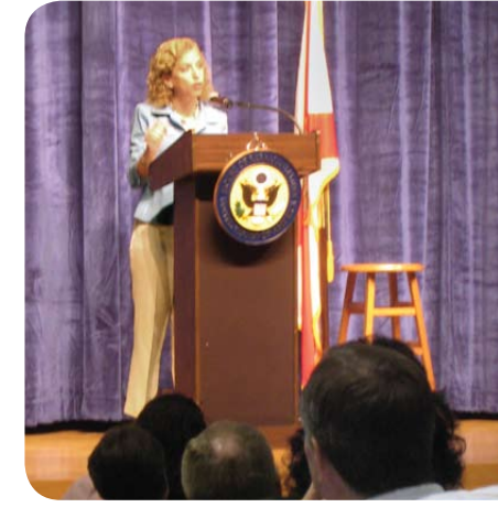
Rep. Wasserman Schultz hosted a listening session on the economy with local residents in Miami Beach in January.