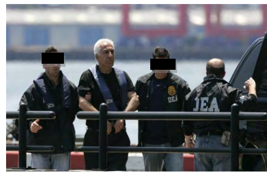
Top photo: Monzer Al Kassar in 1998. Bottom photo: DEA transport Al Kassar, known as "the Prince of Marbella," to the U.S. for trial.