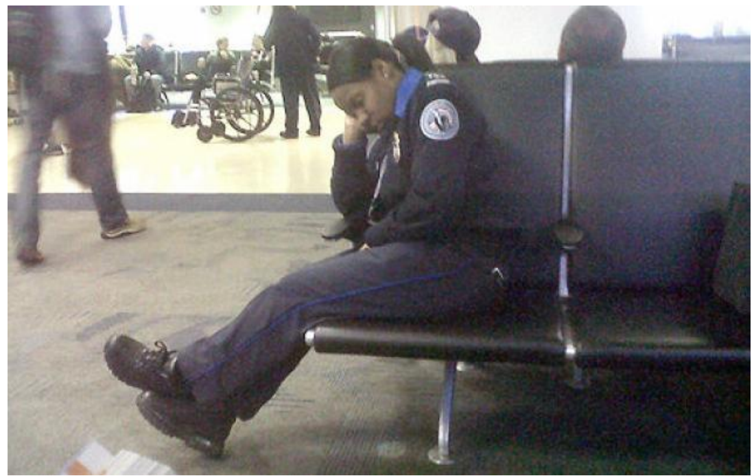
A TSA Transportation Security Officer takes a nap at LaGuardia Airport while on duty.

"Among these public servants are TSA's workforce, men and women who report to their posts each day motivated by the motto, "not on my watch."... Perhaps the next time you are going through airport security, taking a moment to convey respect and thanks to the Transportation Security Officers, the folks in the new blue uniforms, would offer well deserved recognition. After all, your safety is their priority."