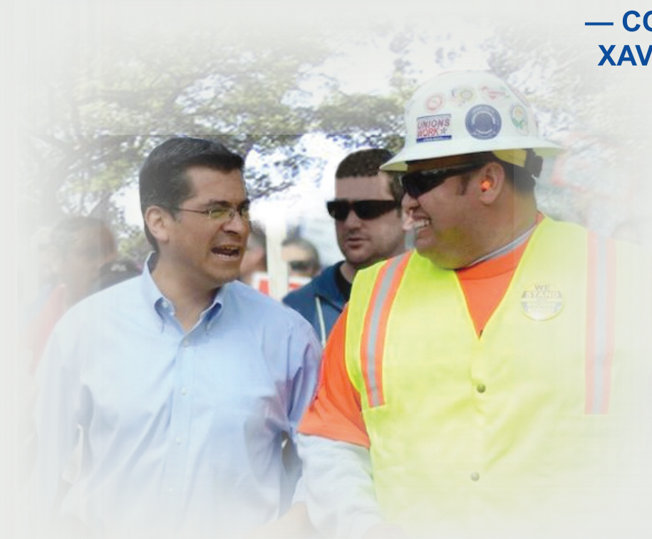
Rep. Becerra meets with workers to discuss jobs in Los Angeles, CA. March 26, 2011.

Si desea esta información en español, por favor llame al (213) 483-1425.