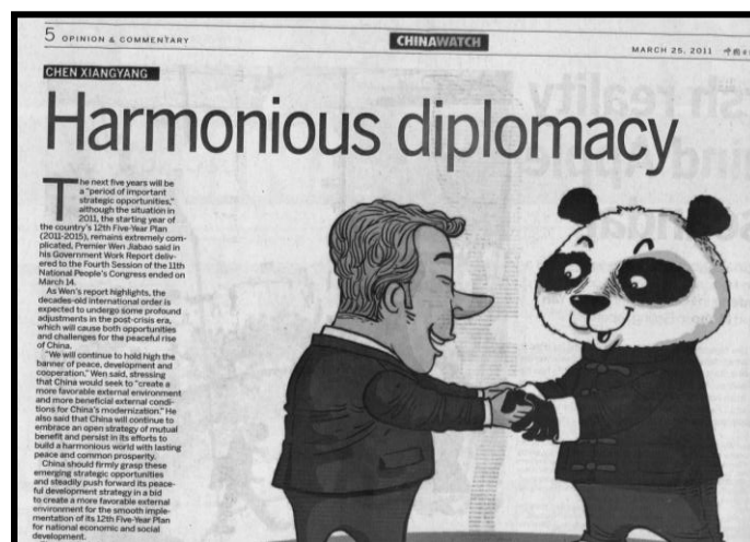
Image: China personified as a friendly panda expresses its desire for a harmonious international order in this “advertorial” insert (provided by the PRC state-owned newspaper China Daily ) printed in the Washington Post , March 25, 2011.

It remains to be seen whether the prize will be offered again in December 2011, or if the CCP leadership will decide to quietly retire this embarrassing episode, and allow the Confucius Peace Prize to take its place alongside historical curiosities such the Stalin Peace Prize of the former Soviet Union. 58 But either way, the whole matter does help to illustrate the extent to which the legacy of Confucius has become a reflexive symbol seized upon by the CCP when searching for an appealing image of Chinese culture to present to audiences both at home and abroad.