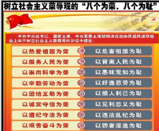
Image: A promotional graphic for the “Eight Honors and Eight Disgraces.” The caption indicates leadership interest at the highest levels, stating that CCP General Secretary Hu Jintao unveiled the concept in a speech at the Chinese People’s Political Consultative Conference.