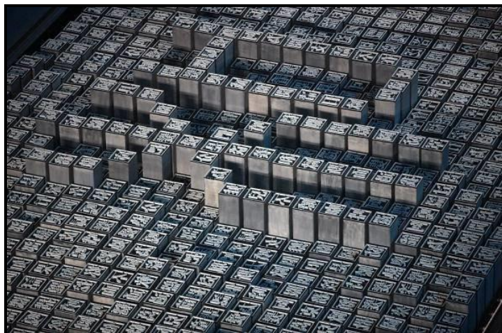
Image: In the opening ceremonies for the 2008 Beijing Olympics, performers moving blocks representing the characters of a printing press use them to form the character for “harmony” (和 / he).

The themes of order and harmony were reinforced when the disciples of Confucius were followed by a panorama of rising and falling blocks, intended to represent the blocks of a giant, animated printing press. Commenting at one point on the undulating blocks of the printing press, the narration noted the similarity of these movements with that of wind blowing across a field, and that Chinese viewers would appreciate the linkage to an aphorism of Confucius: “The virtuous leader can pass across his subjects with the ease of the wind.” The blocks then worked collectively to produce a giant version of the character 和 [he], or “harmony” – a central character of the slogan “Harmonious Society” ( image below ). To further underscore this theme, the narration counseled that “[t]he belief in harmony... is really the only hope for sustainable development in China.”