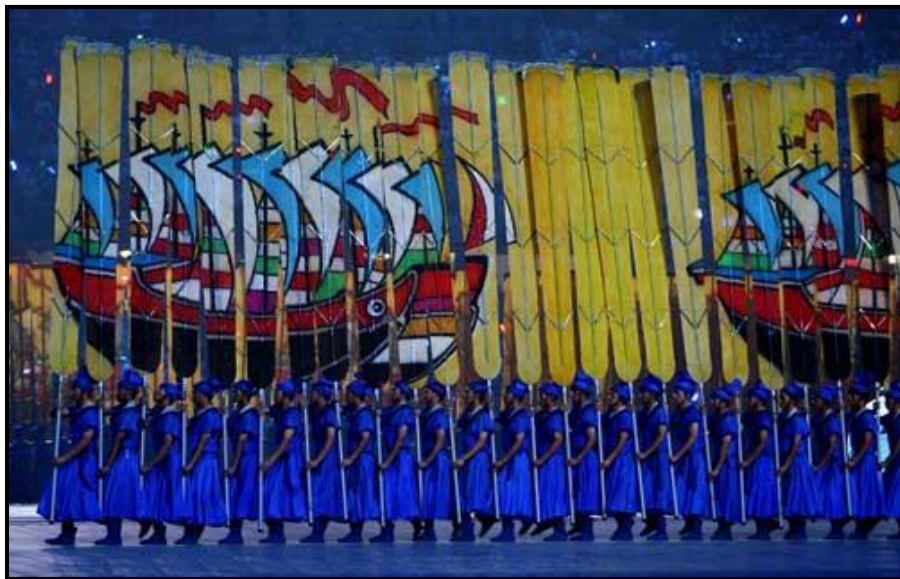
Image: In the opening ceremonies for the 2008 Beijing Olympics, performers handling simulated ships' oars place them together to form images of the ships in Zheng He's 15 th -century fleet.

Zheng He iconography also figured prominently in the 2008 Olympic Games opening ceremonies. In the ceremonies, a massive troupe of dancers wielding oars combined them together to create a mosaic image of Zheng He's ships, sailing the seas to demonstrate China's desire for peaceful exchange with other lands ( image below ).