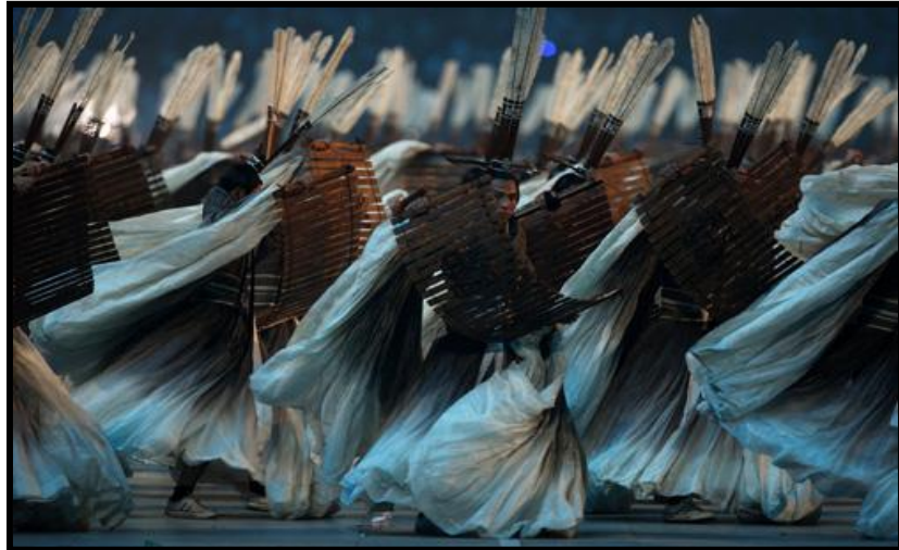
Image: In the opening ceremonies for the 2008 Beijing Olympics, performers dressed as Confucian scholars enter the arena, chanting quotations from The Analects (Lun Yu) of Confucius.