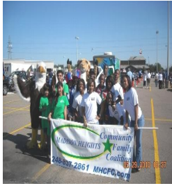
Pictured above are members of the MHCFC

In 2005, about 10.8 million persons ages 12 -20 (28.2% of this age group) reported drinking alcohol in the past month. Nearly 7.2 million (18.8%) were binge drinkers, and 2.3 million (6.0%) were heavy drinkers.