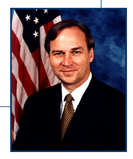
J. Randy Forbes Member of Congress

Congressman J. Randy Forbes 307 Cannon House Office Building, Washington, DC 20515 Phone: 202-225-6365 Fax: 202-226-1170 Web: www.house.gov/forbes