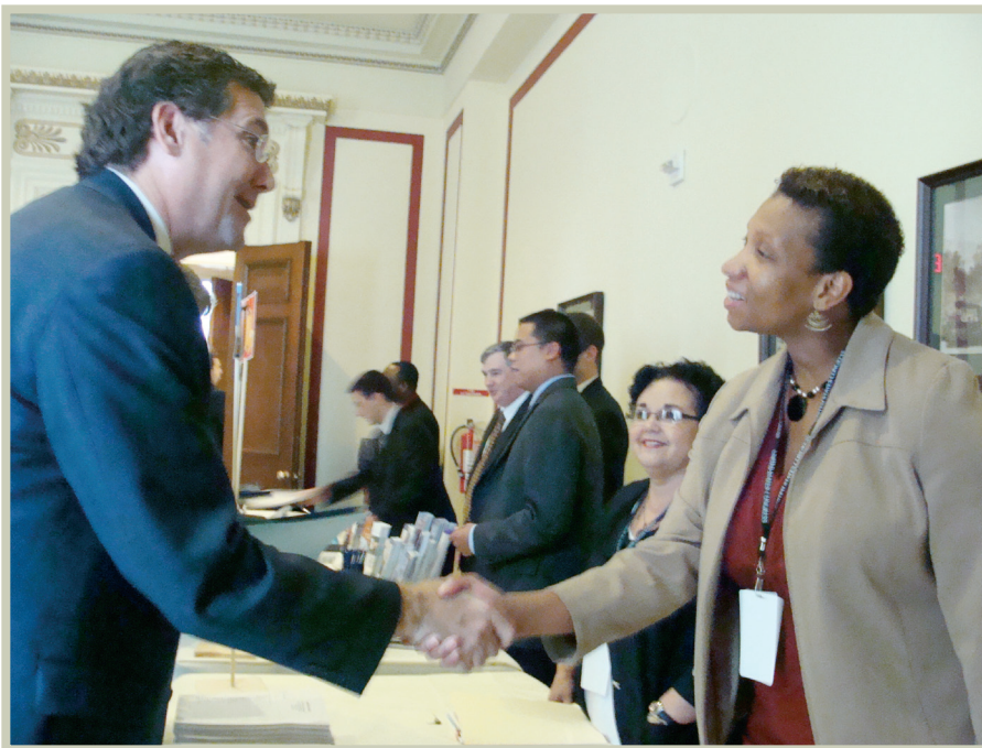
CAO employees greet a Member during the Transition to the 111th Congress.

As soon as election day results roll in, CAO and AOC staff get busy finalizing lists of outgoing Members and setting up office choice lotteries for seated and freshmen Members. CAO and AOC move coordinators meet with Members to discuss floor plans, furniture, carpet, drapes, paint and wiring setups. The AOC does a digital mockup of each office plan, while the CAO tracks related work assignments.