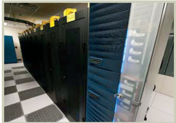
The House's award-winning data center.

It is the only such government effort ever to win a Green Enterprise IT award from Uptime. ♦