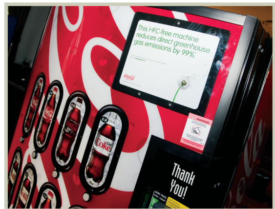
HFC-free Coca-Cola vending machines.