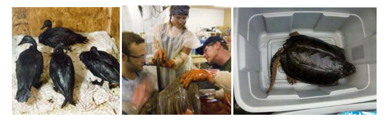
On September 14, 2010, FWS reported that 1,485 wildlife (indicated in the below chart) have been treated at the rehabilitation center.

Assessment. FWS is also working in partnership with other Federal and State agencies to collect and analyze evidence of impacts to natural resources and wildlife as part of the Natural Resource Damage Assessment. FWS established a wildlife rehabilitation center in Marshall, Michigan to stabilize and rehabilitate wildlife that is being rescued by trained wildlife responders.