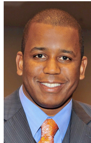
KENDRICK B. MEEK

Member of Congress Chair, Congressional Black Caucus