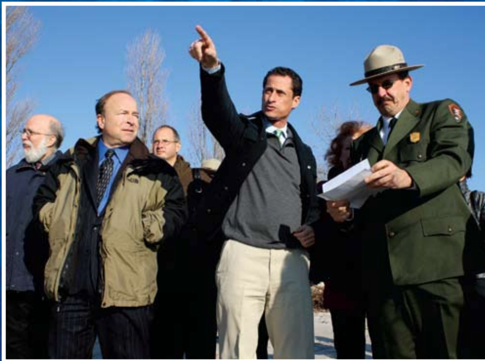
Rep. Weiner leads a tour of environmental officials to show storm damage.

Congressman Anthony Weiner Fights for Queens and Brooklyn