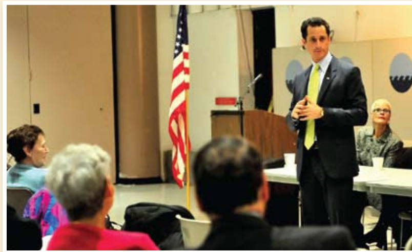
Rep. Weiner holds a town hall meeting to answer questions about his plans in Washington.

When the economy is down, creating jobs is a must. Investing in infrastructure—like schools and our eroding shoreline—makes sense. But with deficits soaring, we have to make sure that we don't pass along the bills to our kids. Rep. Weiner pushed for tough new laws to cut waste in Medicaid and Medicare and eliminate spending that is just plain wrong, like aid to Saudi Arabia. We can get our economy going again and still eliminate waste.