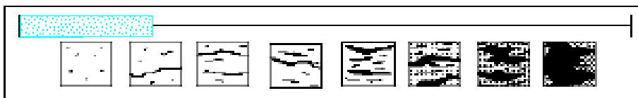
this scale bar shows the meaning of the distribution terms at the current time